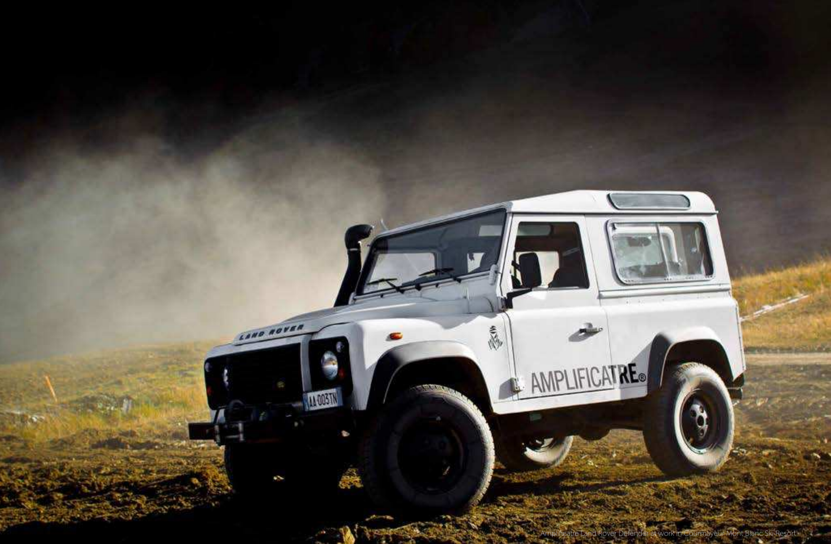
Amplificatre Land Rover Defender at work in Courmayeur Mont Blanc Ski Resort